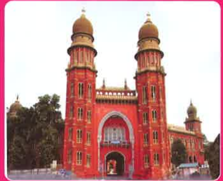
Dr. Ambedkar Govt. Law College, Chennai