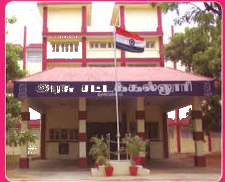
Govt. Law College, Trichy