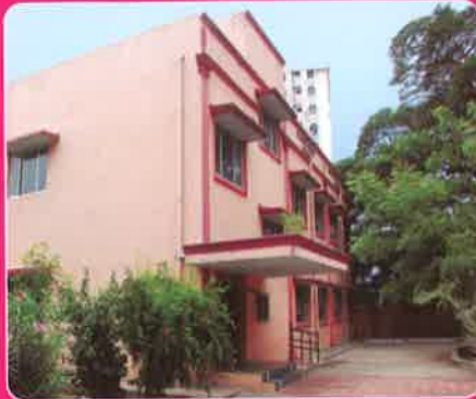
Directorate of Legal Studies, Chennai