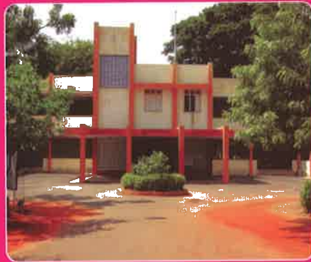
Govt. Law College, Madurai